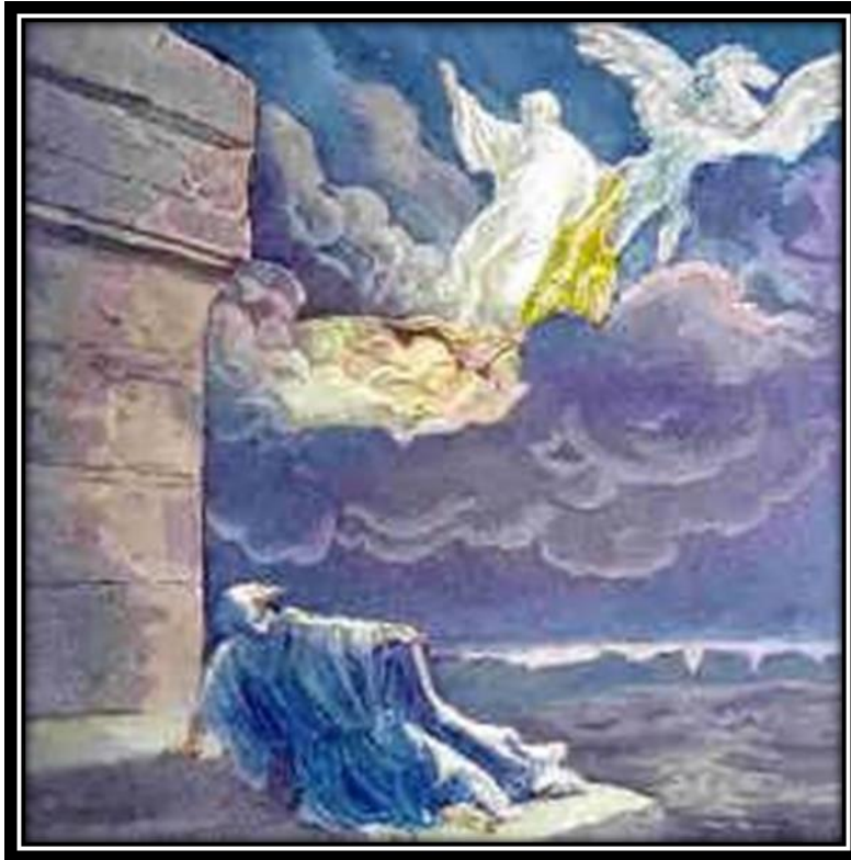
“Elijah taken up to heaven”