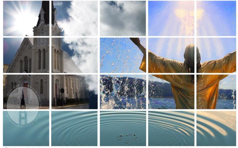
The Vision of the Congregation: We see ourselves as the embracing arms of Jesus Christ for each other, for the community and for the world.