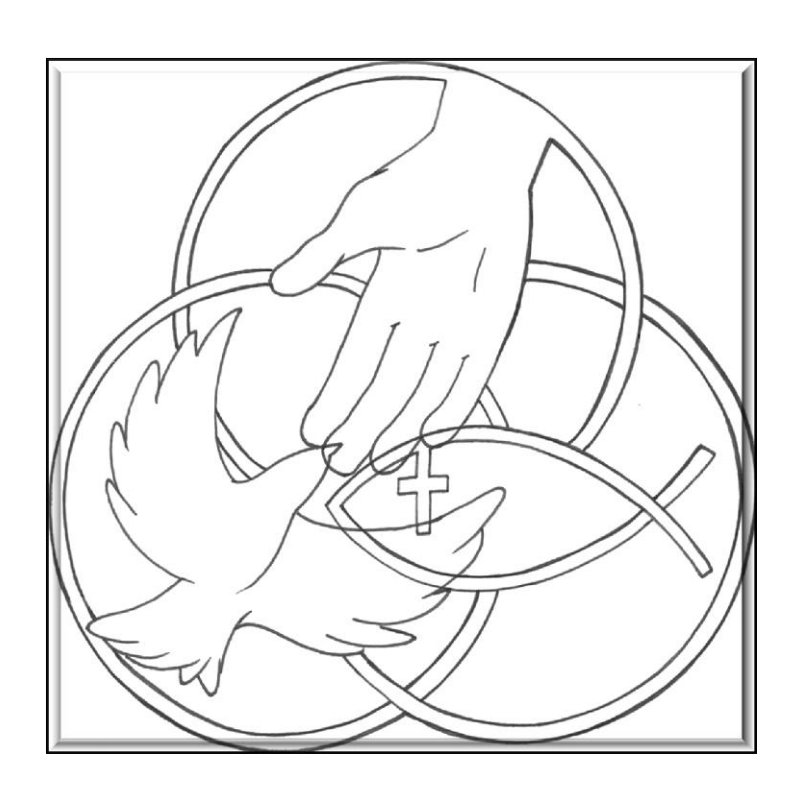
First Presbyterian Church Trinity Sunday June 11, 2017