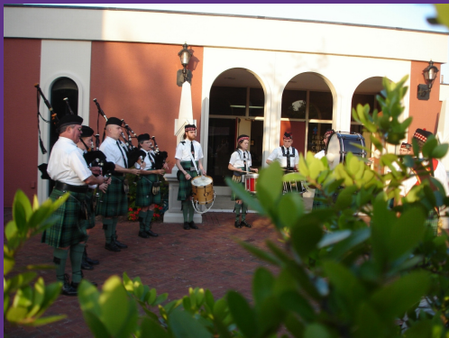
Tidewater Pipes and Drums

Wednesdays this Summer 7:00 PM in the Courtyard